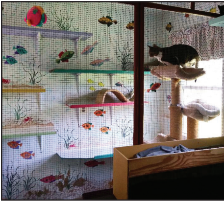
Sweet Kitties Aquarium