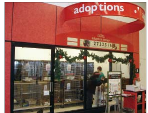
Adoption Center at PETSMART in Downingtown.

In recent times there have been wonderful stories about people volunteering to help rescue pets from disaster situations such as Hurricane Katrina or the Tsunami. If you would like to be involved in helping pets in need but your busy lifestyle prevents traveling out-of-state or out of the country to help, we have the perfect answer for you. Cat Angel Network can satisfy your desire to help closer to home – locally here in Downingtown.