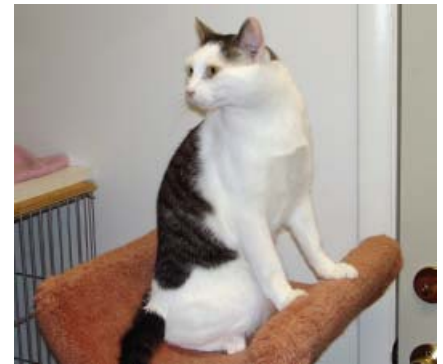
Six months later, fully recovered & ready to go to his new home