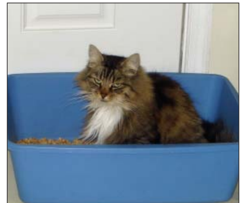
Amber (a.k.a. “Beauty-Kitty”) caught in a private moment. We think the look on her face says it all.

WEEKS to get her back to good habits. Bad habits take time to form, and it takes time to get back to “the box and ONLY the box. Naturally, any problems with the litter (sometimes a kitty has a preference for a different kind of litter), number of boxes, health, or stressful/fearful situations must be addressed before we are given gradual freedom outside the bathroom or cage. Actually, being confined should NOT be viewed as a punishment for us. It is actually the most loving gesture an owner can make to a treasured pet, the opportunity to keep what is most important to a cat, her home and family. 🐾