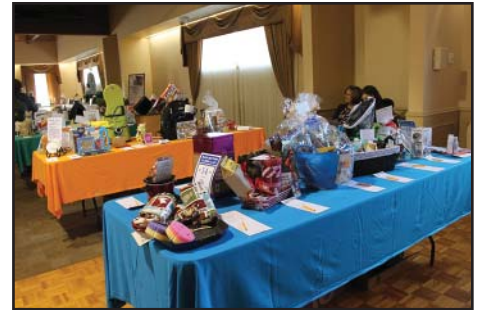
A view of last year's silent auction tables