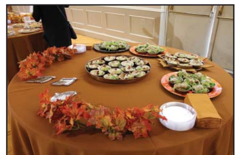
Auction refreshment (tasty treats)!