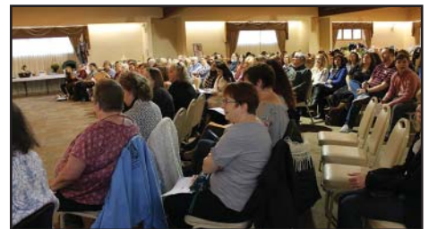
2018 live auction