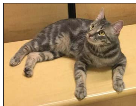
Eitan relaxing at PetSmart Adoption Center

Eitan had a bit of a rough start to his young life. He was found in an abandoned house by two very nice young men who were doing carpentry work there. Thank goodness the carpenters found them or who knows what could have happened! Eitan was named after one of the young men who rescued him. One of our shelter volunteers heard about him and Eitan became a CAN kitty in early January, 2019. He was completely vetted, is happy and healthy and in search of a loving family and forever home.